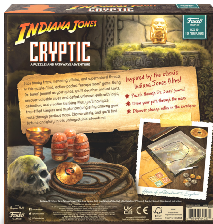
3D Box Back