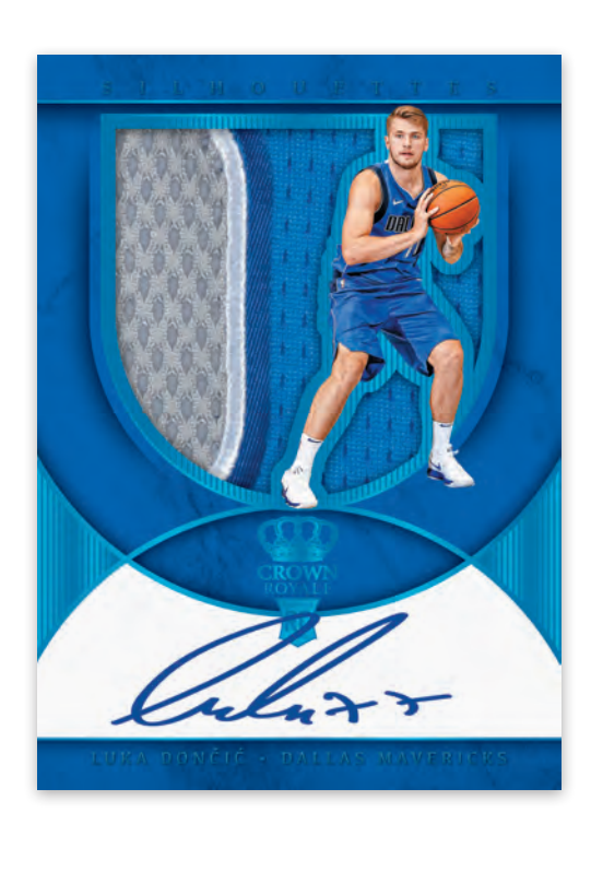
ROOKIE SILHOUETTES SUPER PRIME

Look for stunning Silhouettes and Rookie Silhouettes that feature an on-card autographs and a massive memorabilia swatch!