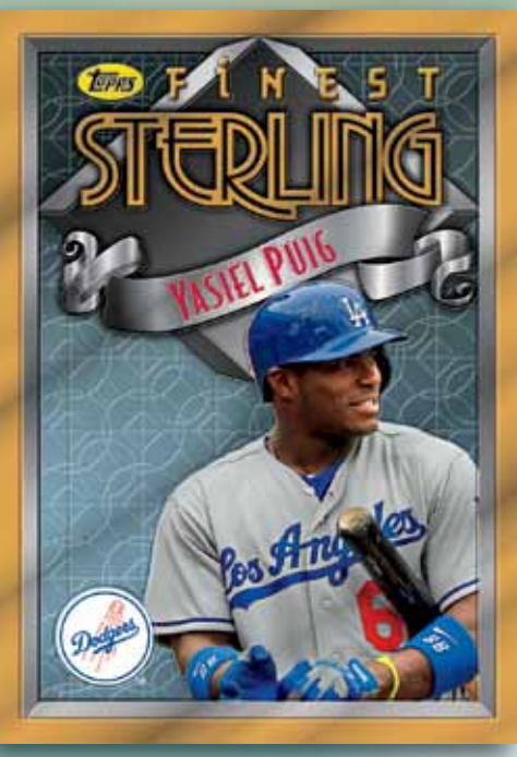
Topps Sterling Insert - Gold Refractor Parallel