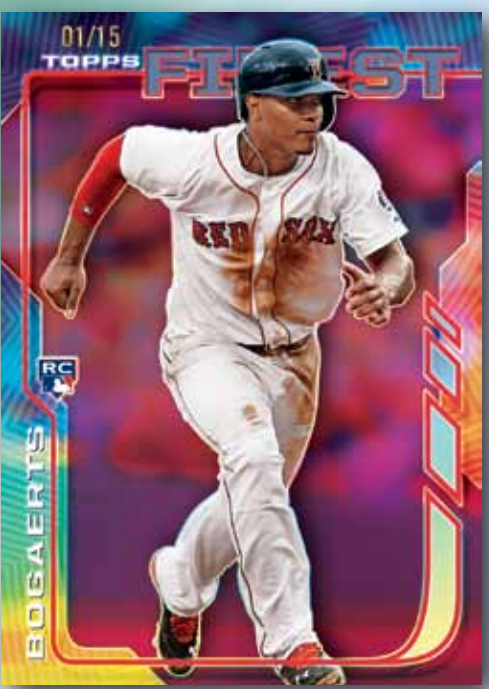
Base Card - Magenta Refractor