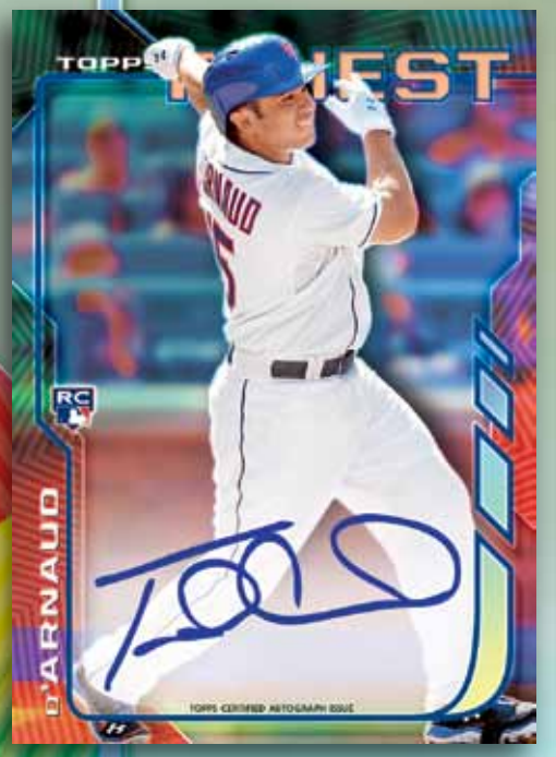
Autographed Rookie Refractor