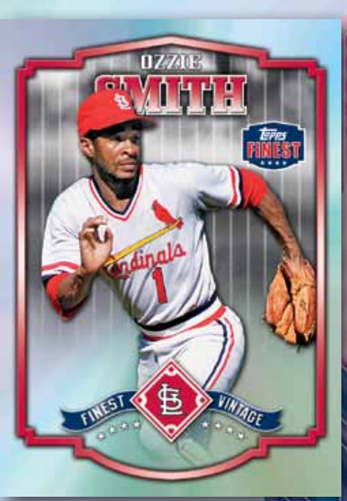
Finest Vintage Insert