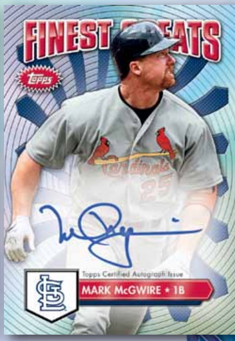
Autographed Finest Greats