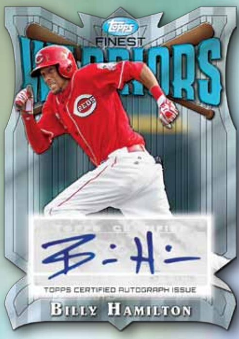
Finest Warriors Die-Cut Refractor Autograph