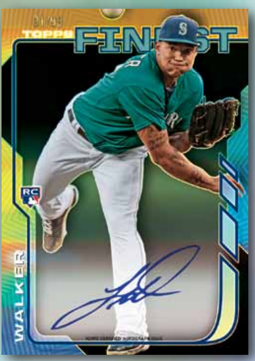
Autographed Rookie Refractor - Black Parallel