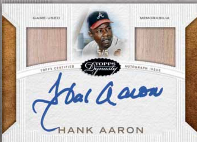
Autographed Dual Relic Great Cards

Up to 100 Cut Signatures from some of the greatest baseball players of all time! Seq #’d 1/1