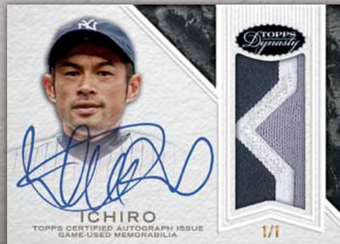
Autographed Patch Cards