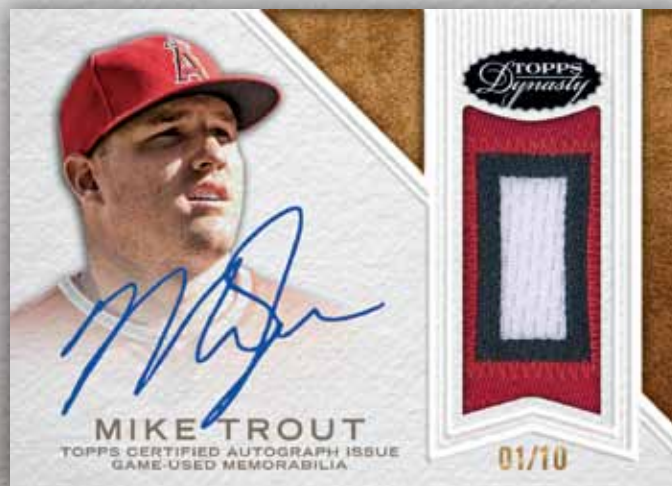
Autographed Patch Card

THE GREATEST HIGH-END BRAND IN BASEBALL IS BACK FOR ANOTHER SEASON!