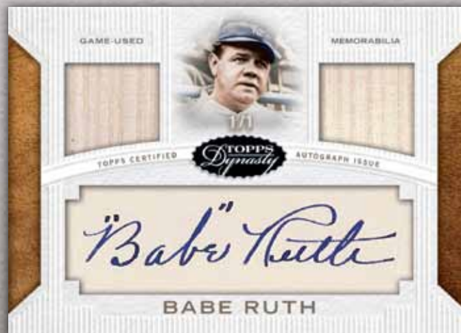
Dual Relic Legend Cut Signature Cards