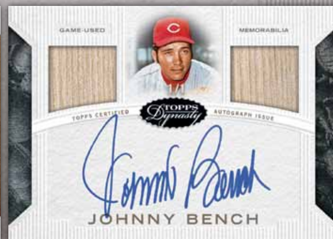
Autographed Dual Relic Great Cards