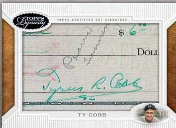
Cut Signature Cards