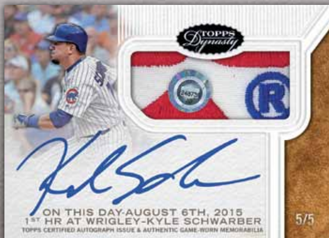
On This Day Autographed Card