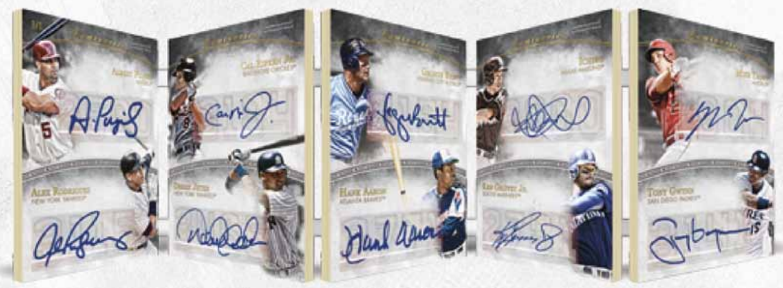
Autographs - Hit Kings Ultra Book Card