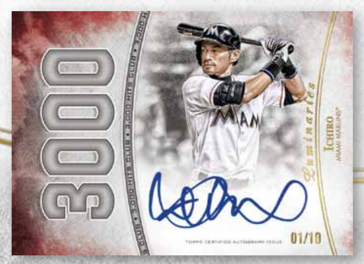
Hit Kings - Red Parallel