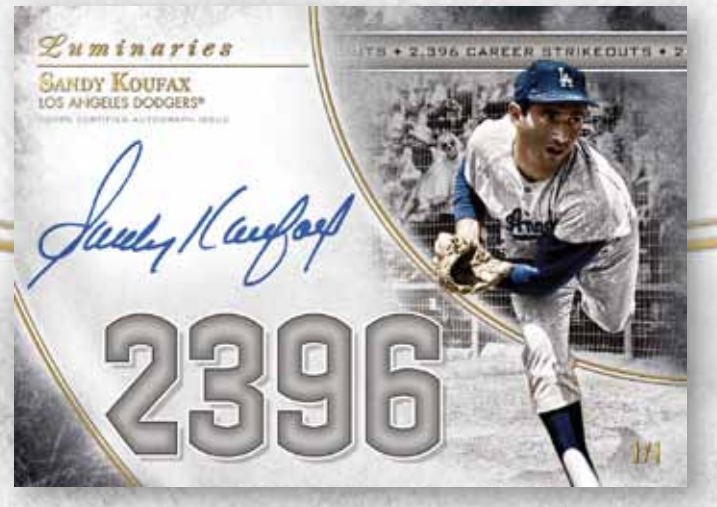
Masters of the Mound - Black Parallel