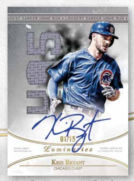
Home Run Kings Autograph Relic Card