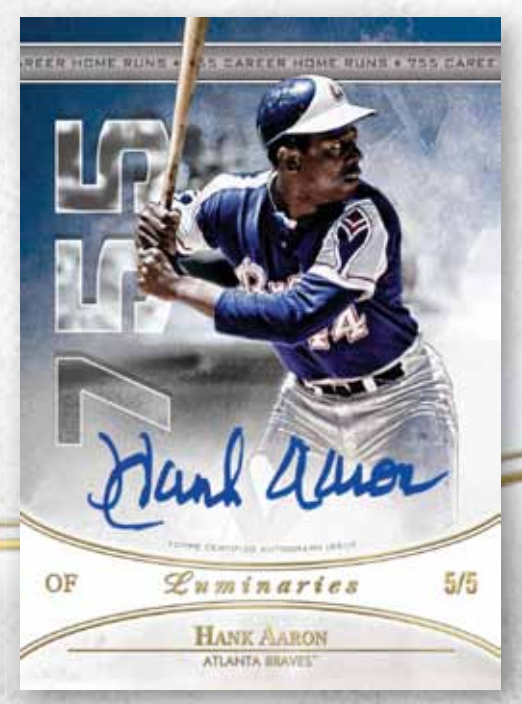
Home Run Kings - Blue Parallel