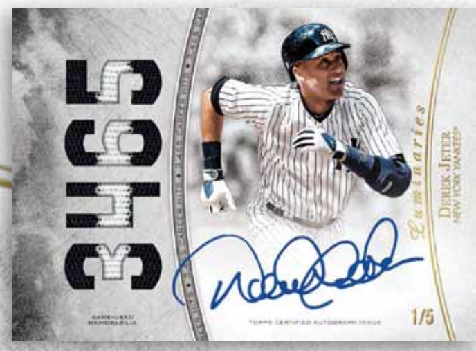
Hit Kings Autograph Patch Card