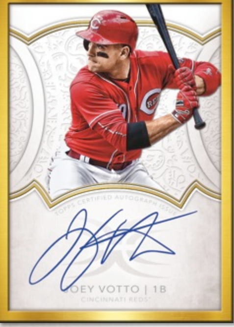
Framed Autograph Collection Card