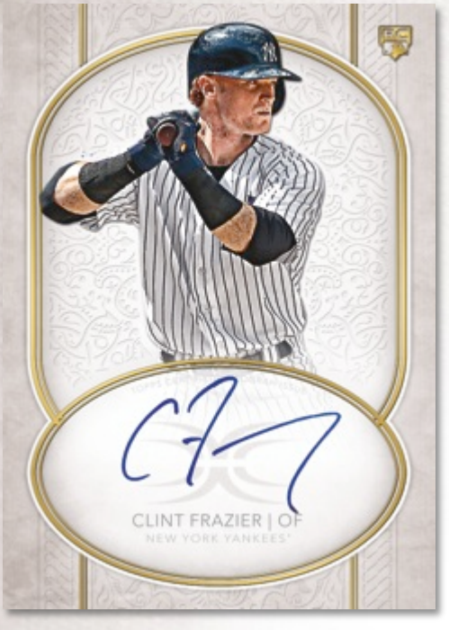
Definitive Rookie Autograph Card