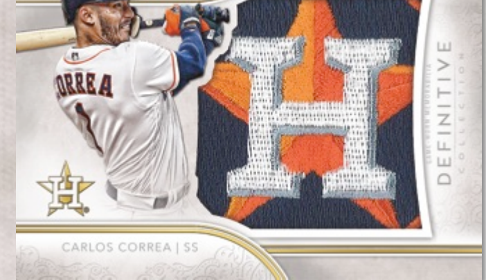
Definitive Patch Collection Card