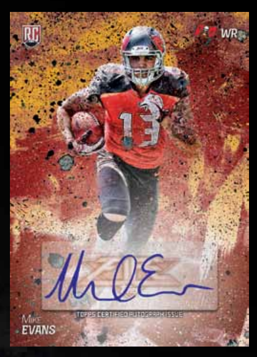
Autographed Rookies - Gold Parallel

TRIPLE AUTOGRAPHS: Up to 5 cards, featuring a combination of veterans and/or rookie autographs. #'d to 15