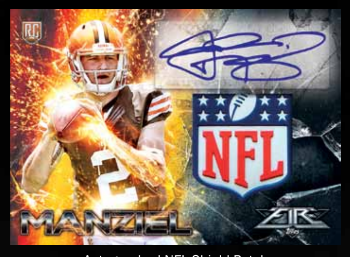
Autographed NFL Shield Patch

• Triple Autographed Patch: #'d 1/1 HOBBY ONLY!