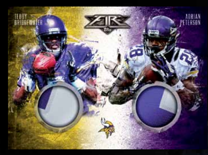
Fire Dual Combo Patches