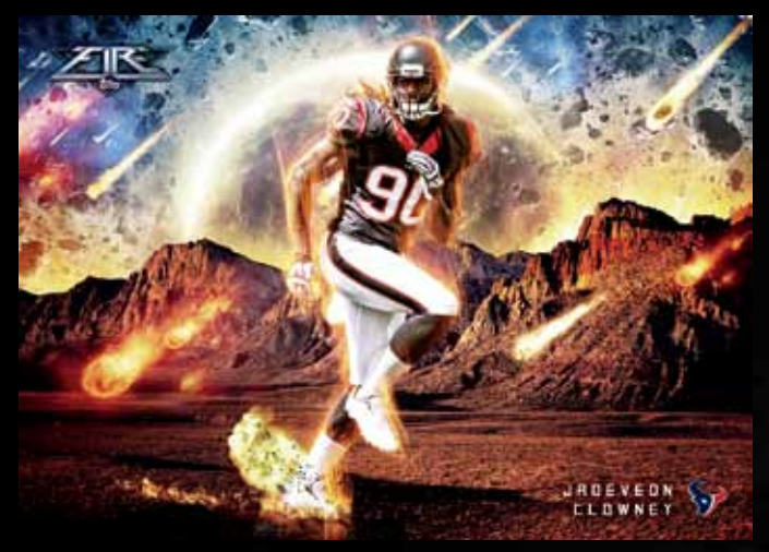
Out Of This World Rookie Card

RING OF FIRE: Features 10 Active and Legendary players who have won one or multiple Super Bowls. (1 per Hobby Box) HOBBY ONLY!