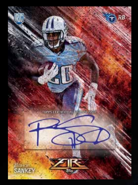
Fire Autographed Card