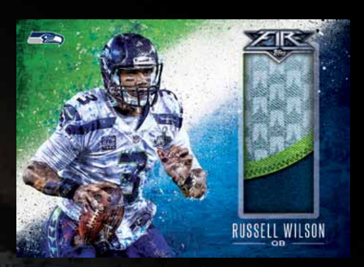
Fire Relic Card

Onyx Patch Parallel #'d to 5 Red Patch Parallel #'d 1/1 HOBBY ONLY!