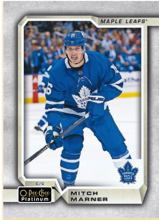
BASE CARD DESIGN