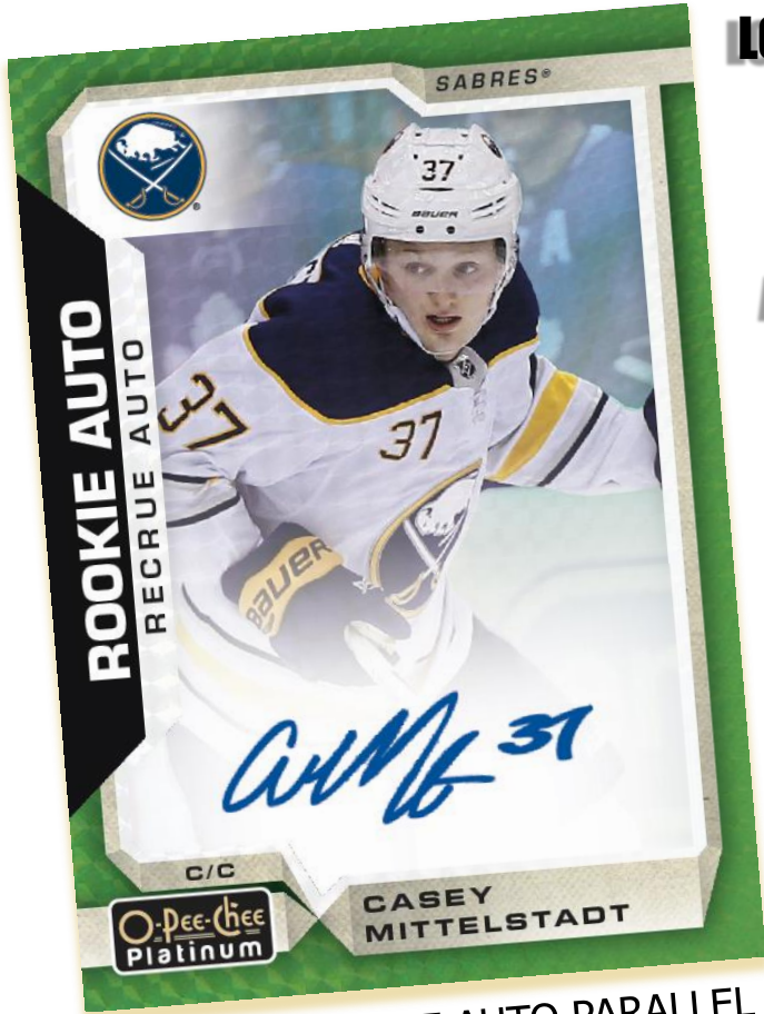
EMERALD SURGE AUTO PARALLEL (#'d to 10)