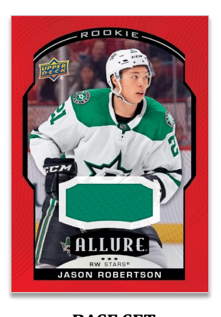
BASE SET Red Rainbow Rookie Jersey Parallel

Allure<sup>™</sup> sports a 150-card Base Set featuring 70 Veterans, 30 Rookies and 50 SP Rookies - the latter falling 1 in every 3 packs, on average!