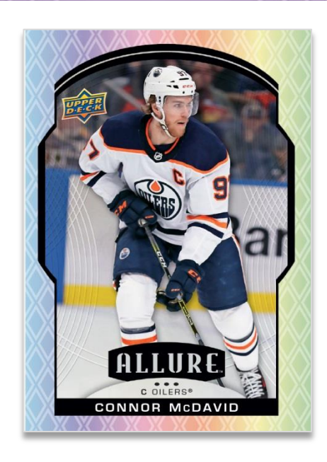
BASE SET White Diamond Parallel (Retail Exclusive!)