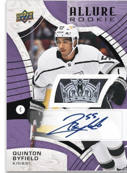
BASE SET ROOKIES Purple Diamond Auto Patch Parallel

2021-22 Allure® sports a 150-card Base Set featuring veterans and rookies - the latter falling 1 per pack , on average.