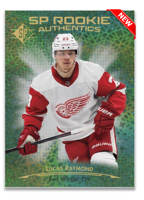
SP BASE SET Blue Parallel